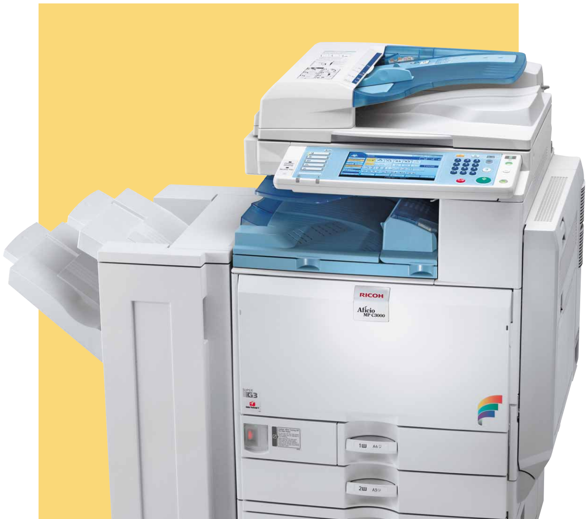
Aficio™ MP C2500/MP C3000